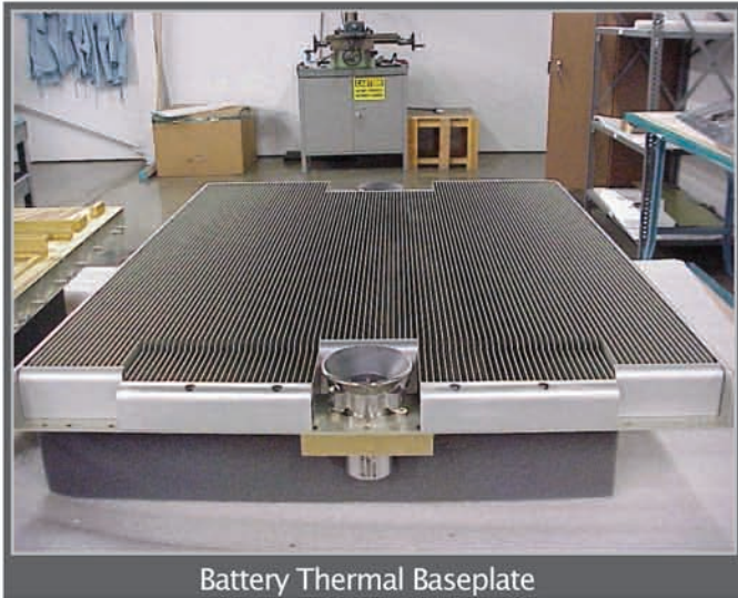
Battery Thermal Baseplate