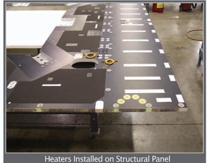
Heaters Installed on Structural Panel