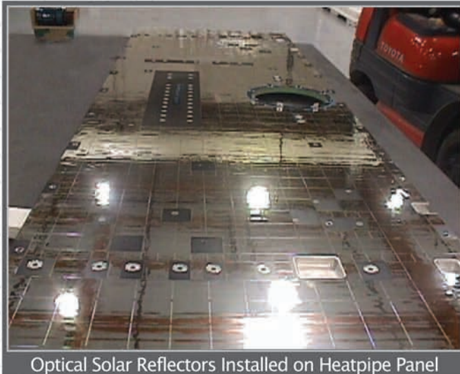
Optical Solar Reflectors Installed on Heatpipe Panel