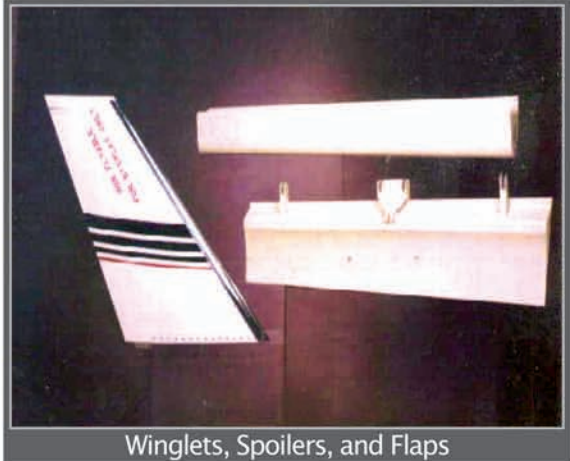
Winglets, Spoilers, and Flaps